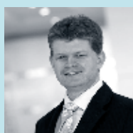
William Coulthard Construction